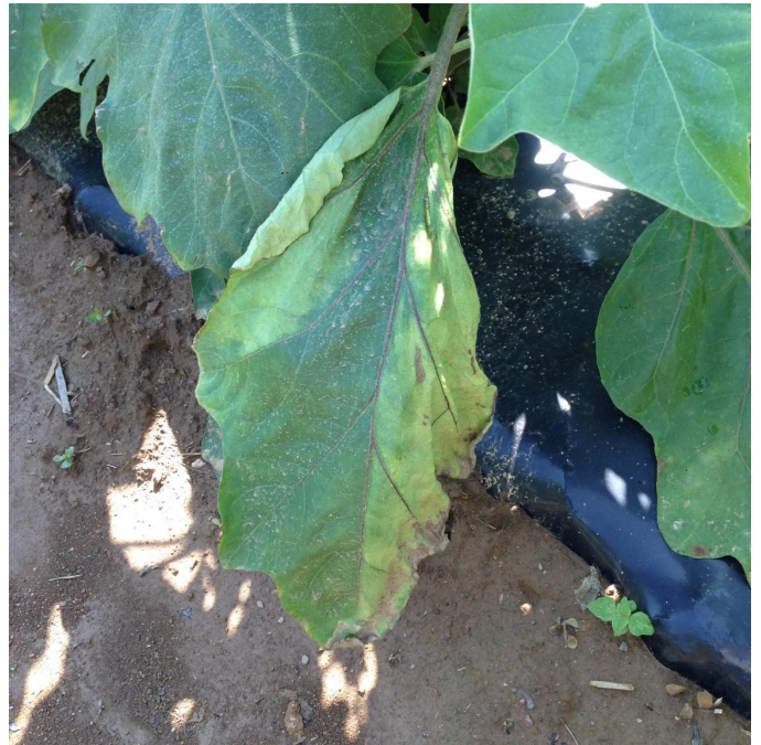
Diagnostic symptoms of Verticillium wilt in eggplant

Solanaceous weeds such as Nightshade may harbor the pathogen. Symptoms can vary between hosts, but on eggplant the leaves of infected plants will typically become lopsided where one side of the leaf will wilt and stop expanding while the other side continues to develop. Vascular tissue near the soil line will become discolored. Eventually the entire plant will collapse as the vascular tissue becomes more infected (clogged) and water movement up the plant stops. There is no resistance to Verticillium wilt in eggplant so long crop rotations with non-susceptible crops are critically important. Some cultivars, such as 'Classic' and 'Epic' may maintain yield in infested fields.