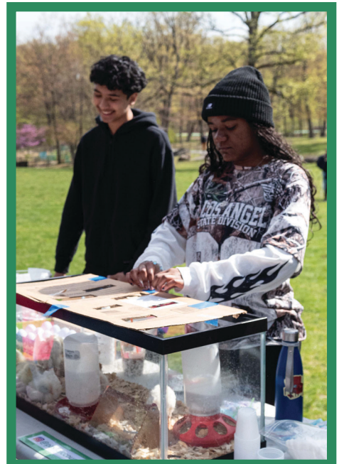
4-Her's helping at the tree planting ceremony