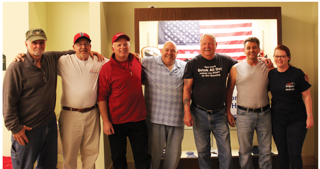
The seven veterans from Lakewood Veterans Affairs who participated in the pilot study in April 2016.