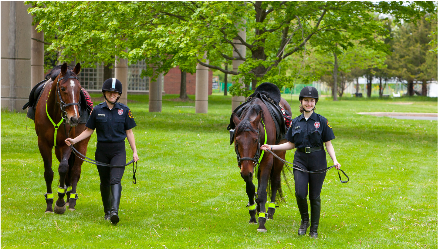
Founded in the 1970's, the Rutgers University Mounted Patrol was originally a part of the Rutgers University Police Department (RUPD) and staffed by RUPD officers. This was eventually transitioned to a student Community Service Officer Program supervised by Rutgers University Public Safety.