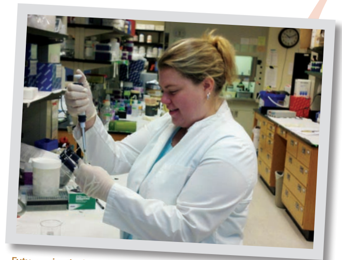
Future scientist in the making!

Within a few short months, I had helped with several treadmill demonstrations including one at Ag Field Day. I also attended the Hambletonian Veterinary Conference as a student representative for the Equine Science Center and helped organize the Pre-Hambletonian Celebration at the new MetLife Stadium on August 4th. The opportunities and experiences I have had thanks to the Equine Science Center are invaluable. If someone told me I would be doing all of this a year ago, there is no way I would have believed them.