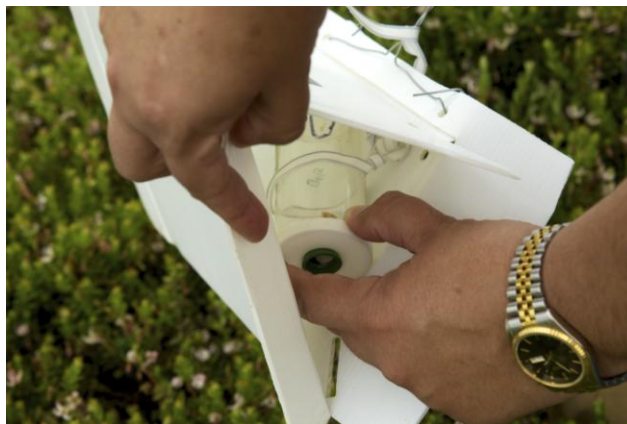
Mating cage to study degree-day requirements for Sparganothis fruitworm mating and oviposition